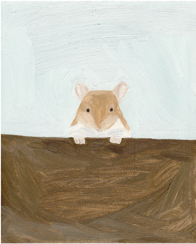
Yuko Murata, Untitled , 2011. Oil on canvas, 27 x 22 cm

is dictated by the specificity of her choice in subject matter, as well as in style and technique. Emphatically un-naturalistic: flat and yet strangely familiar, Murata's landscapes are both naïve and melancholic. The resulting scenes are an understated breed of Pop Art, although dislocated from their source material; they continue to operate as a mirror to the Japanese popular culture so readily consumed by the West.