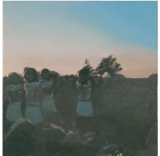
Pere Llobera, Jubilée , 2010. Oil on canvas, 60 x 60 cm

photograph, with paintings such as Summer Nights in the Spanish Villages , 2007 and Jubilée , 2010 complete with the faded tones of under exposed film. His colour schemes are characteristically dark and smoggy with surreal elements often infiltrating his depictions of prosaic, everyday scenes resulting in paintings of a grungy magical realism.