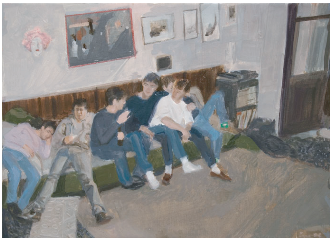
Pere Llobera, Teenagers , 2008. Oil on canvas, 40 x 60 cm

The forthcoming exhibition at Hidde van Seggelen Gallery Pere Llobera, Yuko Murata and Jacco Olivier presents a cross section of contemporary, figurative painting from Europe and Japan. Shown together for the first time, the exhibition will feature works on paper and canvas by Yuko Murata alongside a new series of works by Pere Llobera and an animation by painter-filmmaker Jacco Olivier. United by their translation of the everyday into an alternative landscape – be that psychological, romantic or melancholic – each of the artists presents the viewer with a fantastical vision of reality.