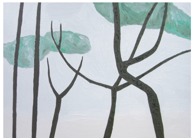
Yuko Murata, Green Clouds , 2011. Oil on canvas, 24.2 x 33.3 cm

Yuko Murata fuses the traditions of Eastern and Western painting. Adopting the heavily stylized, flat planes of 18th Century Japanese woodcuts, she renders paint in a thick brushwork. Her output is typified by paintings of a humble scale depicting solitary animals and spare landscapes. Mining her imagery from second-hand sources such as magazines, postcards and encyclopedias, Murata's practice