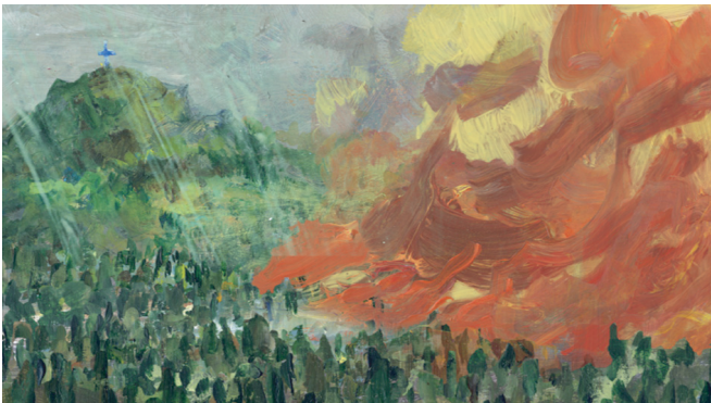
Film still: Jacco Olivier, Almost , 2009. Video, sound. 1 min 35 secs

is dictated by the specificity of her choice in subject matter, as well as in style and technique. Emphatically un-naturalistic: flat and yet strangely familiar, Murata's landscapes are both naïve and melancholic. The resulting scenes are an understated breed of Pop Art, although dislocated from their source material; they continue to operate as a mirror to the Japanese popular culture so readily consumed by the West.